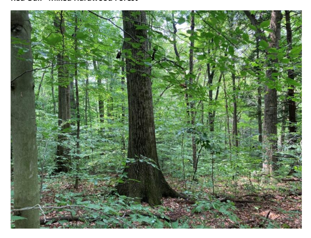
Red Oak - Mixed Hardwood Forest